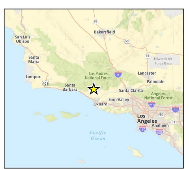
Fig 1 Regional Location